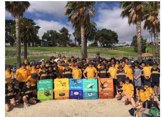
Point Lonsdale and St Mary's Primary School Environment Days